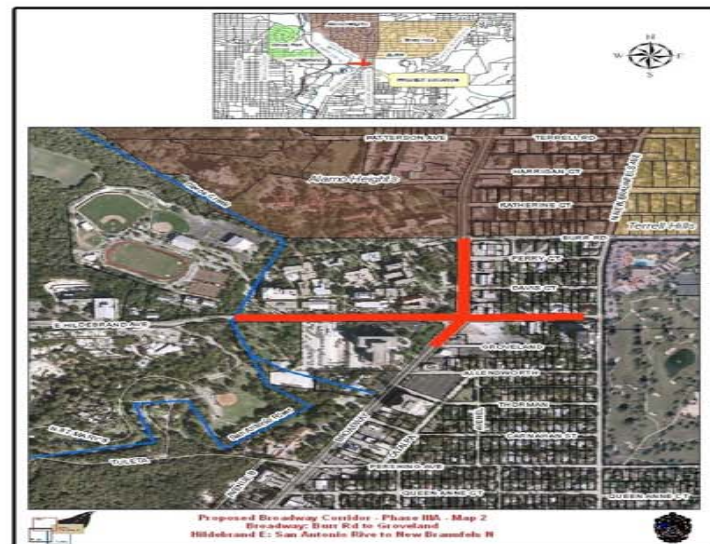
Proposed Broadway Corridor - Phase IIIA - Map 2 Broadway, from Groveland to Hildebrand Hildebrand E. San Antonio River to New Braunfels R.